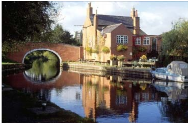
River Soar at Barrow-on-Soar