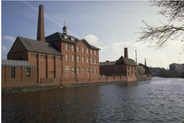
Factory buildings alongside the River Soar in Leicester.