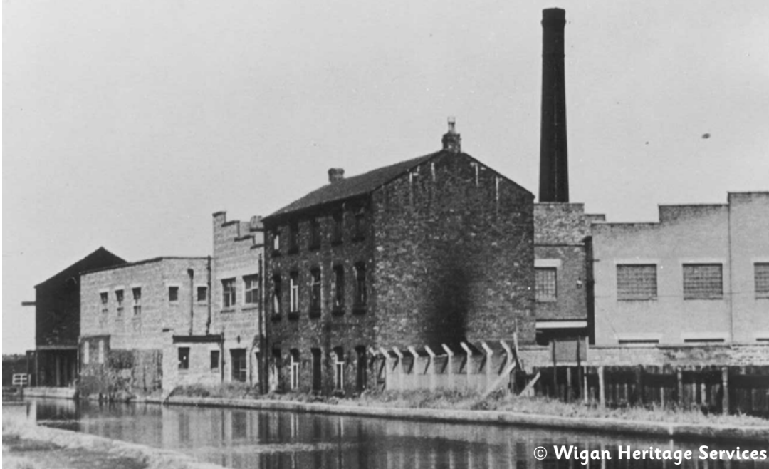
Welsh Hill Mill in the mid twentieth century.