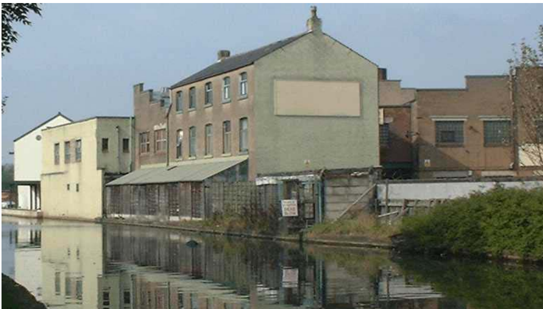
Welsh Hill Mill, 2002.